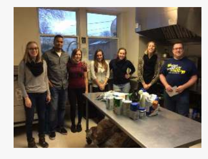
A big thank you to the <u>Human</u> <u>Rights Campaign</u> and <u>United Way</u> <u>Arise Project</u> volunteers who deep cleaned and cooked at Brooklyn Avenues and Minneapolis Avenues on Martin Luther King Day!