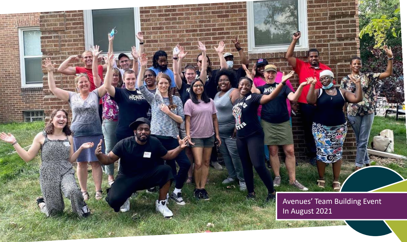
Avenues' Team Building Event In August 2021